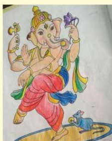
Advait III B