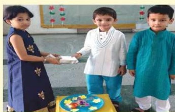
NEO KIDS RAKSHABANDHAN