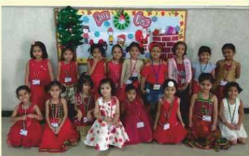
NEO KIDS CHRISTMAS CELEBRATION