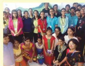
VISIT TO DIVYAPRABHA ORPHANAGE