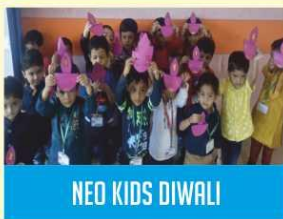
NEO KIDS DIWALI