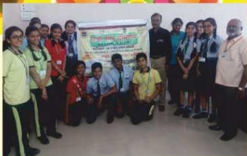
USING SWACHH BHARAT APP