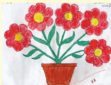
Saanvi Rane Nursery D