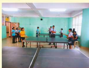
TABLE TENNIS COMPETITION