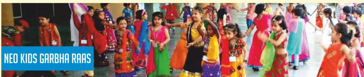
NEO KIDS GARBHA RAAS