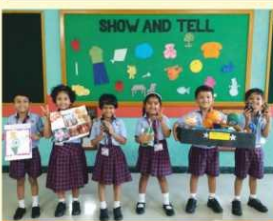
NEO KIDS SHOW & TELL COMPETITION